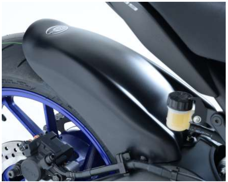
In This Kit There Should Be 1x Rear Hugger (RGH0010BK) 1 x S0230 Spacer